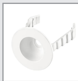
Holder for indicator LED in emergency operation