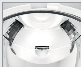
DAX 100mm 1000lm 8xx SNC