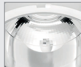
DAX 200mm 2000/3000lm 8xx SNC