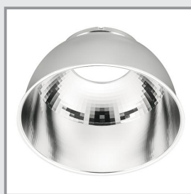
Reflector for DAX module with 60°