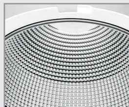
DAX 150mm 1000/2000lm 8xx SNC