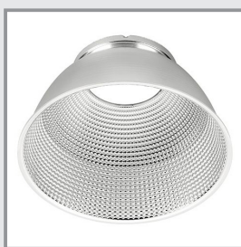
Reflector for DAX modules with 90°