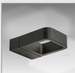
Pitt LED wall light